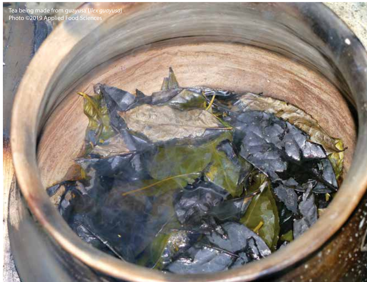
Tea being made from guayusa ( Ilex guayusa )

Sequeda-Castañeda et al. (2016) 33 summarized a number of investigations of the safety of guayusa preparations and attest an excellent safety profile. No signs of hepatotoxicity were found in an in vivo hepatotoxicity model using Wistar rats. No acute toxicity was shown at 1,000, 500, 250, and 125 mg/kg ethanol extract in animals. Repeat doses were also found to be safe. Due to the high caffeine content, however, large quantities can affect the nervous system. Bussmann et al. (2011) 59 demonstrated a LC 50 > 10,000 \mu g/mL for an aqueous extract and 300 \mu g/mL for an ethanol extract of guayusa leaves in the brine shrimp lethality assay. Kapp et al. (2016) 60 found guayusa concentrate to be negative in in vitro genotoxicity tests, including the Ames test and a chromosome aberration study in human lymphocytes. This confirmed previous results finding an LD 50 > 5,000 mg/kg for female rats. A 90-day sub-chronic study at 1,200, 2,500, and 5,000 mg/kg/d of guayusa concentrate administered to male and female rats found effects comparable to those of caffeine, including weight loss, reductions in food efficiency and triglycerides values, increases in serum alanine aminotransferase, serum aspartate aminotransferase, and cholesterol, as well as adaptive salivary gland hypertrophy. Overall, no harmful effects specific to guayusa or its components were observed in any of the tested models.