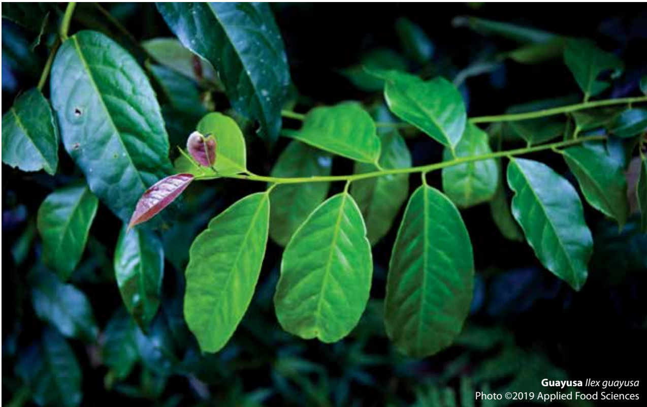
Guayusa Ilex guayusa

an extract of the leaves in cosmetic products is authorized specifically for skin-protecting function. 31 However, for oral ingestion, I. guayusa is presently classified as an unauthorized novel food in the EU. According to EU regulatory authorities, I. guayusa was not used as a food or food ingredient in the EU before May 15, 1997, and, therefore, a pre-marketing safety assessment under the Novel Food Regulation is required. 32