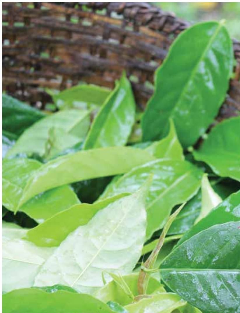
Guayusa Ilex guayusa

A 1683 letter from Jesuit priest Juan Lorenzo Lucero to the Viceroy of Peru, Don Melchor de Navarra y Rocafull,