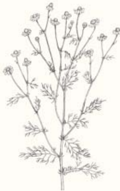
Illustration © 2003 Peggy Duke

When using a dietary supplement, purchase it from a reliable source. For best results, use the same brand of product throughout the period of use. As with all medications and dietary supplements, please inform your healthcare provider of all herbs and medications you are taking. Interactions may occur between medications and herbs or even among different herbs when taken at the same time. Treat your herbal supplement with care by taking it as directed, storing it as advised on the label, and keeping it out of the reach of children and pets. Consult your healthcare provider with any questions.